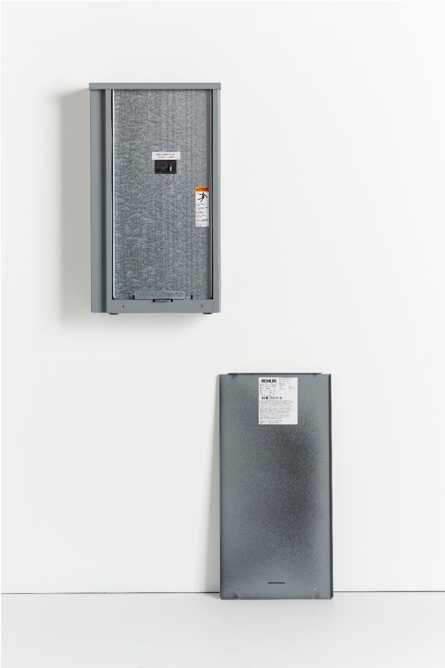
Recalled Kohler Automatic Transfer Switch - Inside cover