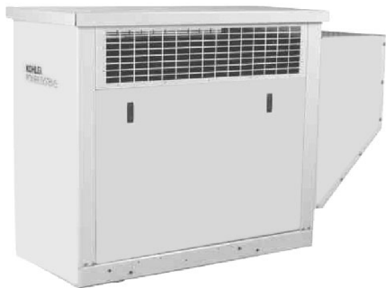
Weather Enclosure with Sound Kit